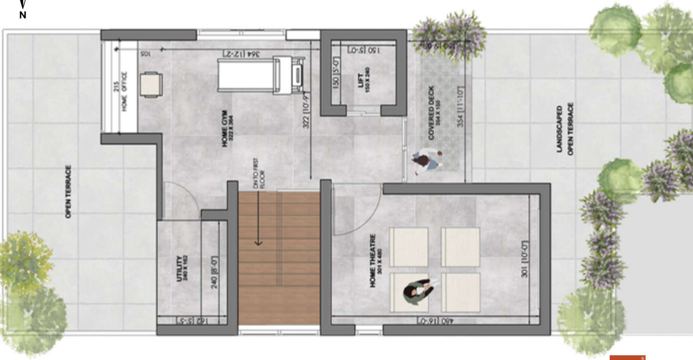
SF- 645 SOFT