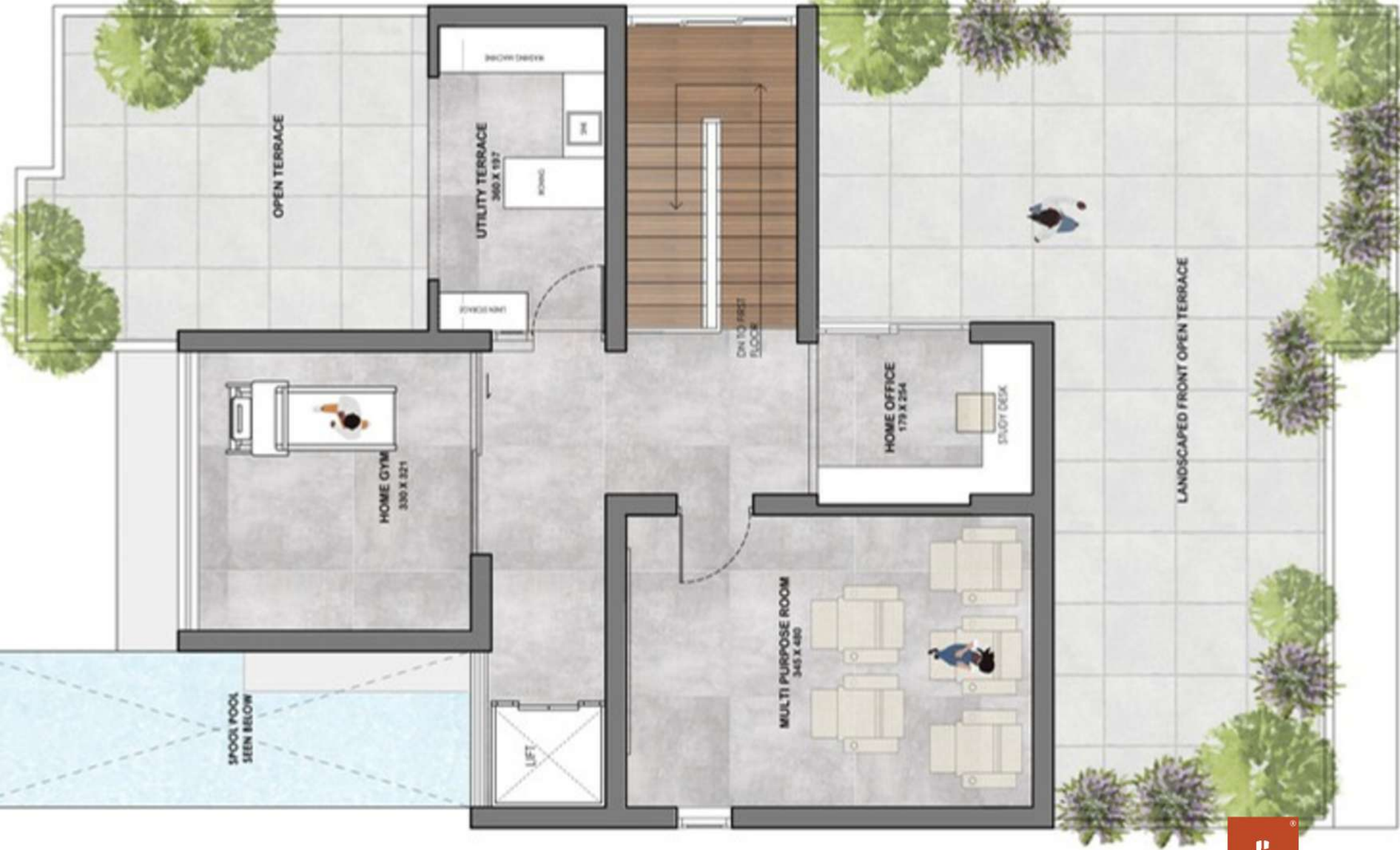
Second Floor-766 SQFT